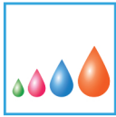
Piezo Variable Drop