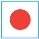
Made in Japan