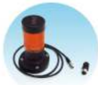
Pass-through Door Switch Module