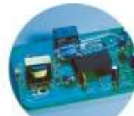
SmartGUARD™ Fire Alarm (Patented)