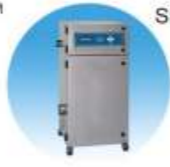
Fume Extraction System