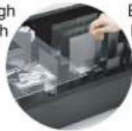
SmartBOX™ Cutting Accessory