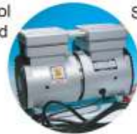
Air Compressor Unit