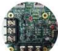
External Control Interface Board